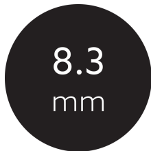
Length of particular segments