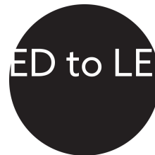
Distance relating to