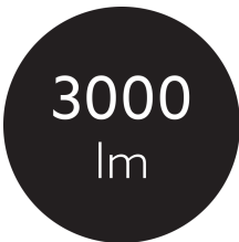
Luminous flux per meter