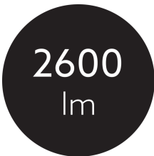
Luminous flux per meter