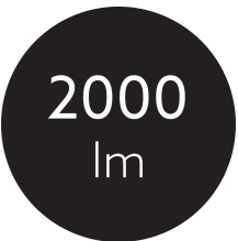
Luminous flux per meter