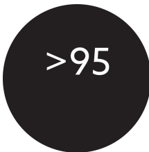
Colour rendering index CRI