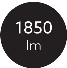
Luminous flux per meter