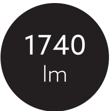
Luminous flux per meter