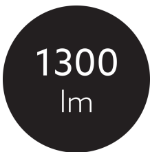
Luminous flux per meter