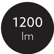
Luminous flux per meter