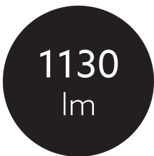
Luminous flux per meter