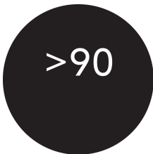
Colour rendering index CRI