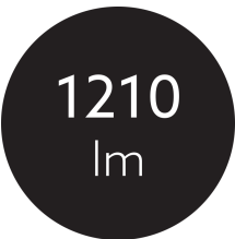
Luminous flux per meter