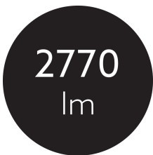
Luminous flux per meter